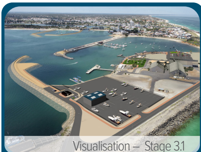
Visualisation – Stage 3.1