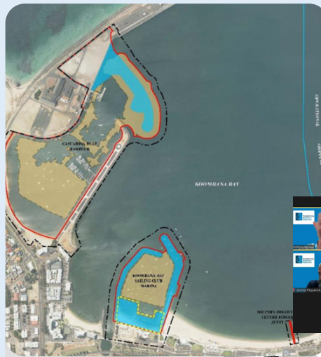
Below: An online information session on June 13 2023 gave people the chance to hear about the overall project as well as the environmental review including how to have their say.

The original vision for the project was unveiled to the public in October 2015 and was well supported by the community. The first two stages are largely complete. These stages incorporate the Koombana foreshore revitalisation, Dolphin Discovery Centre redevelopment, reconstruction of the Jetty Road causeway, and Casuarina Drive redevelopment.