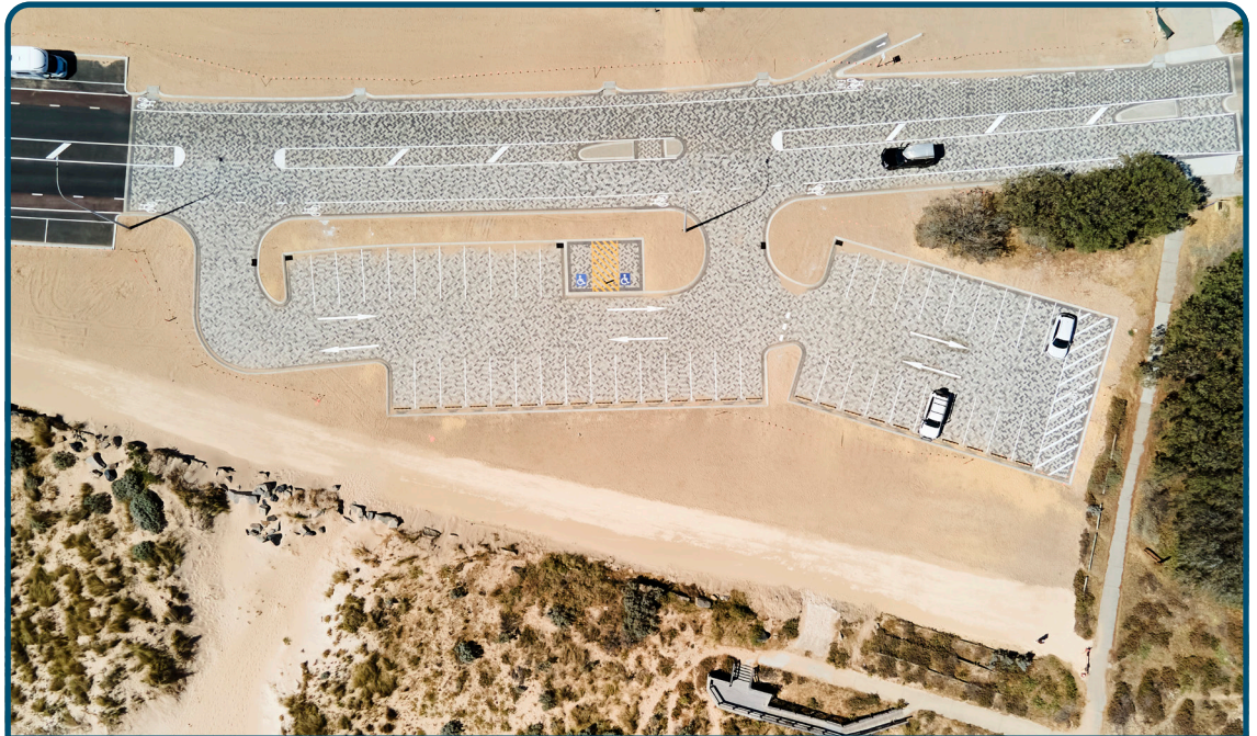
A sealed car park at BP Beach is among the features delivered through the Casuarina Drive Scope 2B Redevelopment as part of the Transforming Bunbury's Waterfront project.